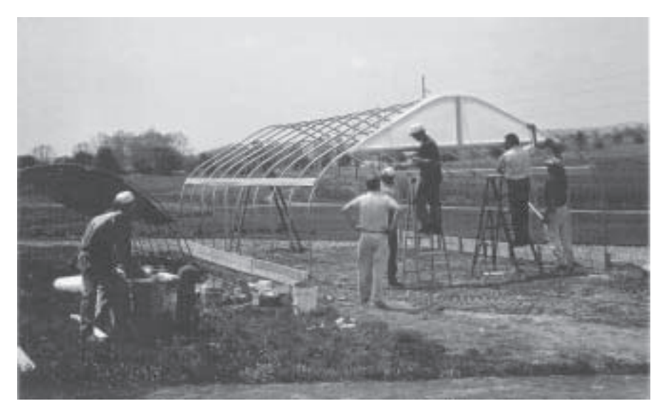
Fig. 5. Erection of a high tunnel using the Penn State design at the Milton Hershey School, Hershey, Pa., provided an opportunity for hands-on training for county extension agents from southeastern Pennsylvania.