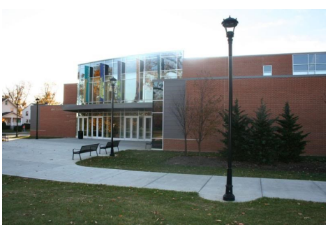
Boyd Cultural Arts Center and Auditorium on the Wilmington College Campus

WILMINGTON COLLEGE is located at: 1870 Quaker Way, Wilmington, OH 45177