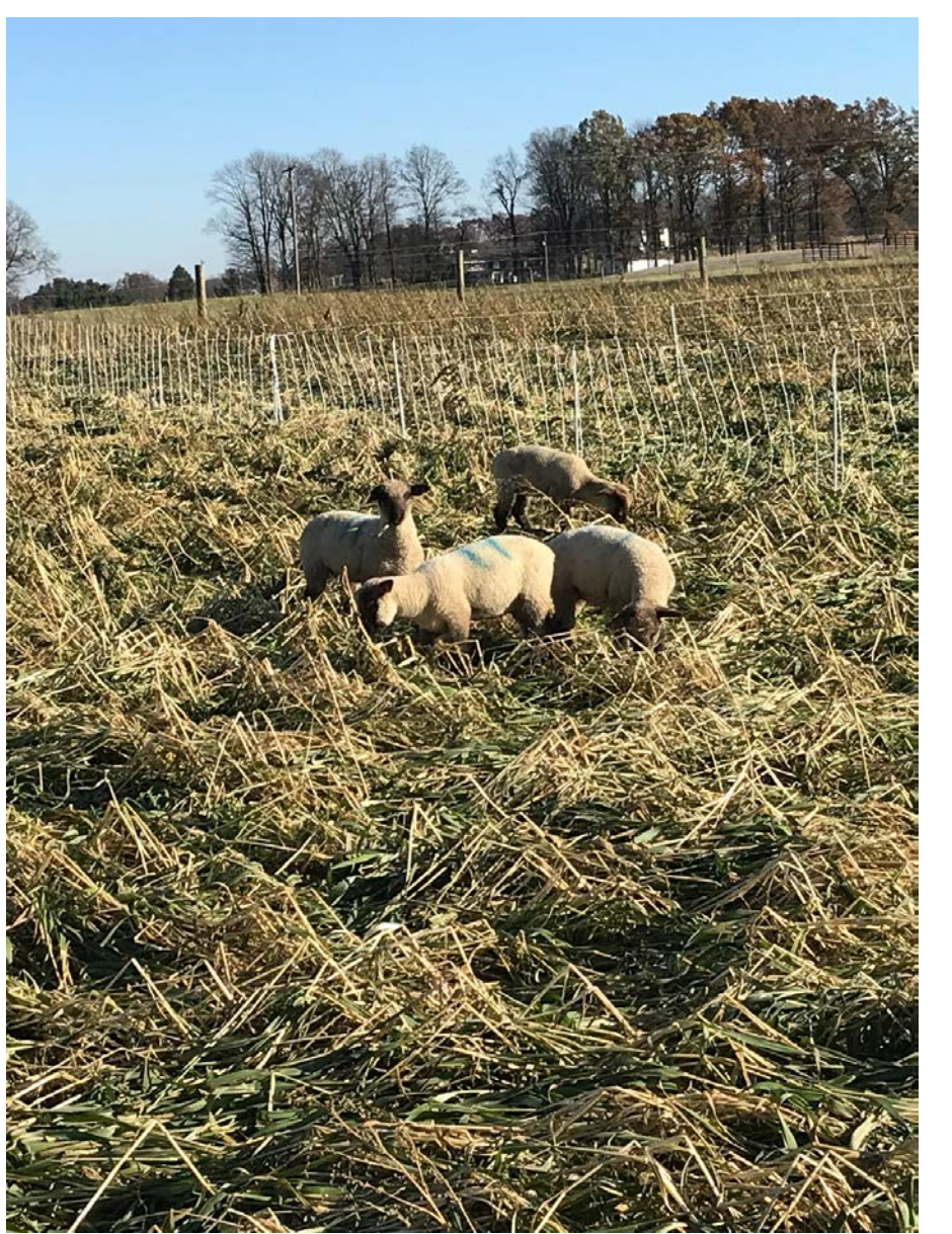
You can utilize different forages and pastures in your system.