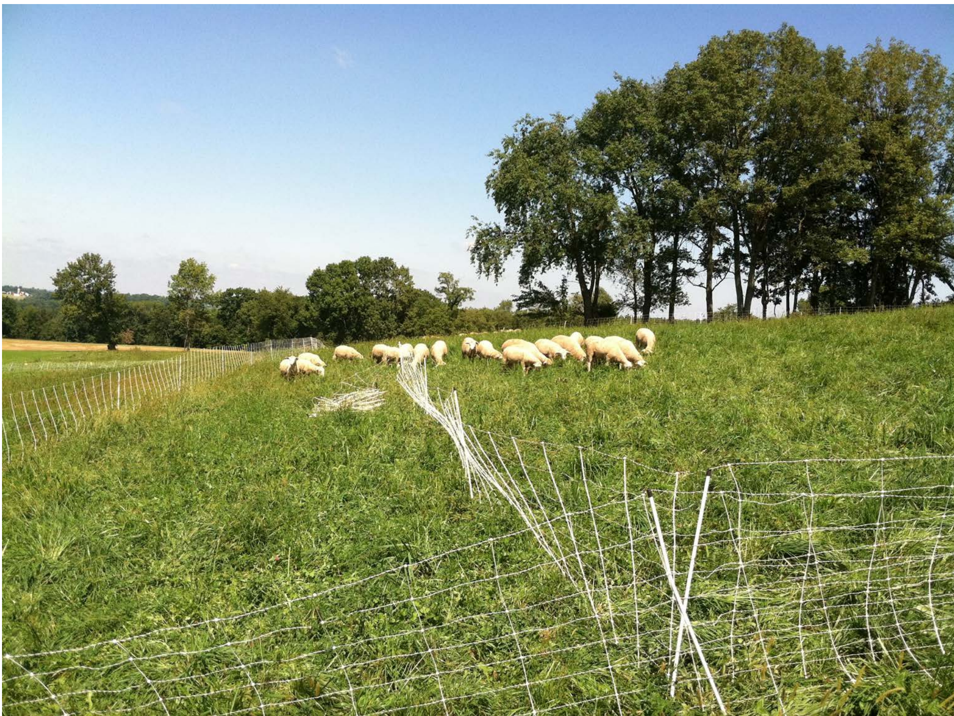
The use of portable electric fencing makes rotational grazing easy.