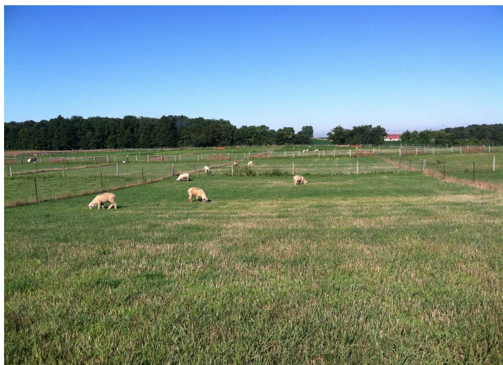
Making sure you have enough land and fencing is crucial to starting a rotational grazing system on your farm.