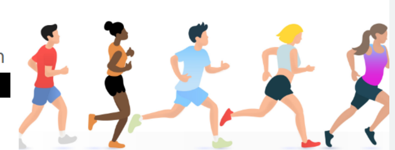
The Route ran throughout OSU's campus