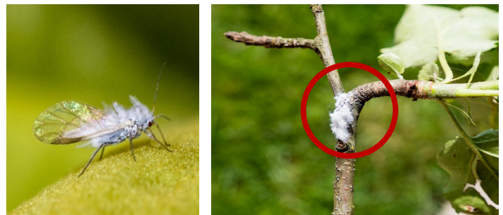
Figure 1: A winged Woolly apple aphid (WAA) adult shown above and a colony on an apple limb (right). Note that both images showcase the filamentous wax produced by individual to ward off natural enemies.

lightly blow on the infested spots to determine the number of aphids present. Identifying root infestations can be more challenging, but gall formation on roots is a common indicator. If you can uproot part of the tree, you may also see nymphs. Root-feeding individuals do not have long filamentous secretions but short rod-like filaments. Root-dwelling forms also appear redder in comparison to the aerial-forming aphids found on branches and twigs.