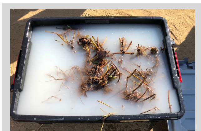
Figure 2. Fungicide application of bare root strawberry plants for prevention of root and crown diseases.