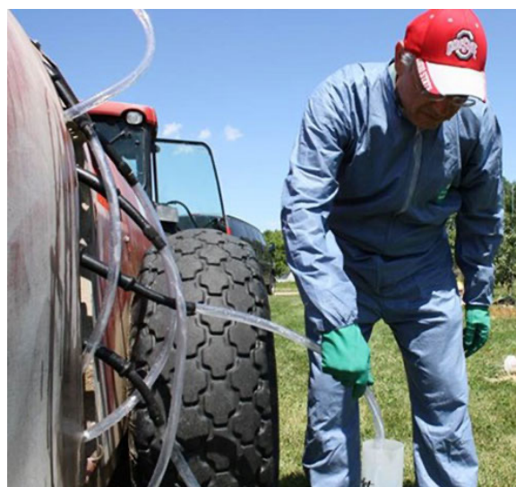
Figure 1. A sprayer can only be effective, efficient, and safe if it's properly checked and calibrated before it's taken to the field.

Once all the nozzles on the sprayer are checked to make sure they are not clogged or worn out, the sprayer is ready for calibration. Two key measurements are needed to calibrate a sprayer – actual ground speed and nozzle flow rate.