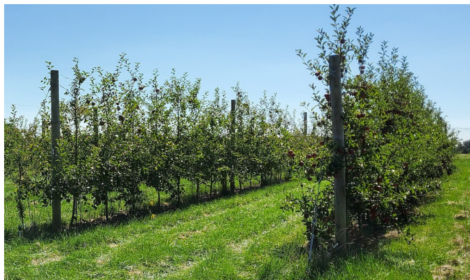
CFAES-Wooster apple orchard in 2021.

Adequate moisture and weed control are key to ensuring a strong start for newly planted trees. A good rain within a few days after planting will settle the soil around the tree roots and provide moisture for the tree to grow. If rain is not predicted soon after planting, water should be applied to the newly planted trees. Good weed control gives the tree an area without weed competition in which to establish roots. Tree fruit roots are not very competitive with weed roots, and restricted tree rooting area results in less water and nutrient uptake and less tree growth.