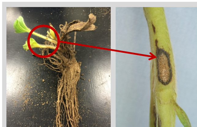
Figure 1. Lesion on strawberry petiole. Do not plant transplants with visible lesions on roots, petioles, stems or leaves.

Clean water – When overhead sprinklers are used to establish plants in the field clean water should be used. City and well water are recommended. Surface water (i.e., pond or irrigation ditch water) is a source of plant pathogens including Phytophthora and Pythium and should be avoided if possible. If surface water is used it should be filtered and treated before being applied to the plants.