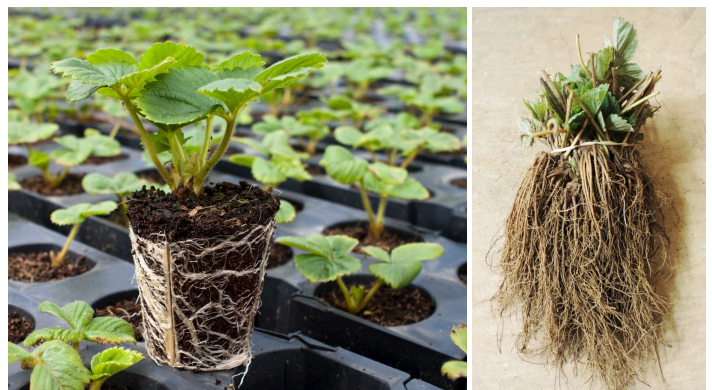
Figure 1. Strawberry transplants can be purchased as plugs (left) or bare roots (right).

bundle and check for root discoloration. Cut the crown tissue longitudinal and look for discoloration. To confirm if plants are diseased