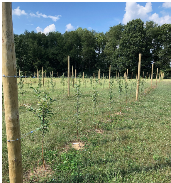
Newly planted apples at CFAES-Wooster in 2019.