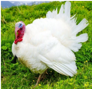
Broad Breasted White