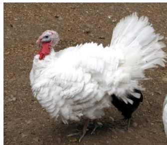
Beltsville Small White