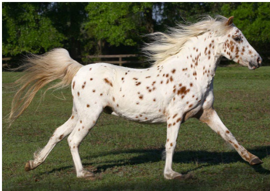
Pony of the Americas