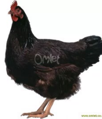
Rhode Island Red