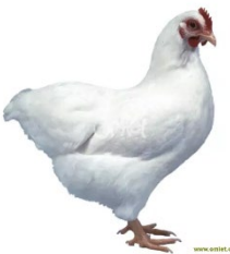
Plymouth Rock White