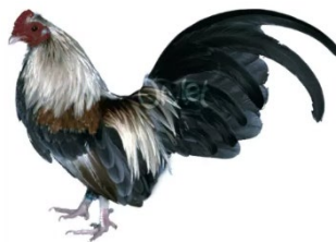
Old English Game