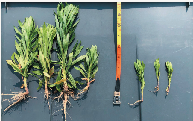
Figure 1. Horseweed collected from plots with no cereal rye (left) and with cereal rye. 2

the fall so the outcomes are known before seeding cover crops in questionable fields later in the fall.