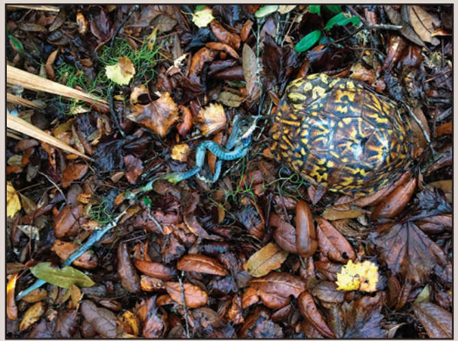
Fig. 1. Adult female Terrapene carolina (Eastern Box Turtle) scavenging a Thamnophis sauritus (Eastern Ribbonsnake) on Jekyll Island, Georgia, USA.