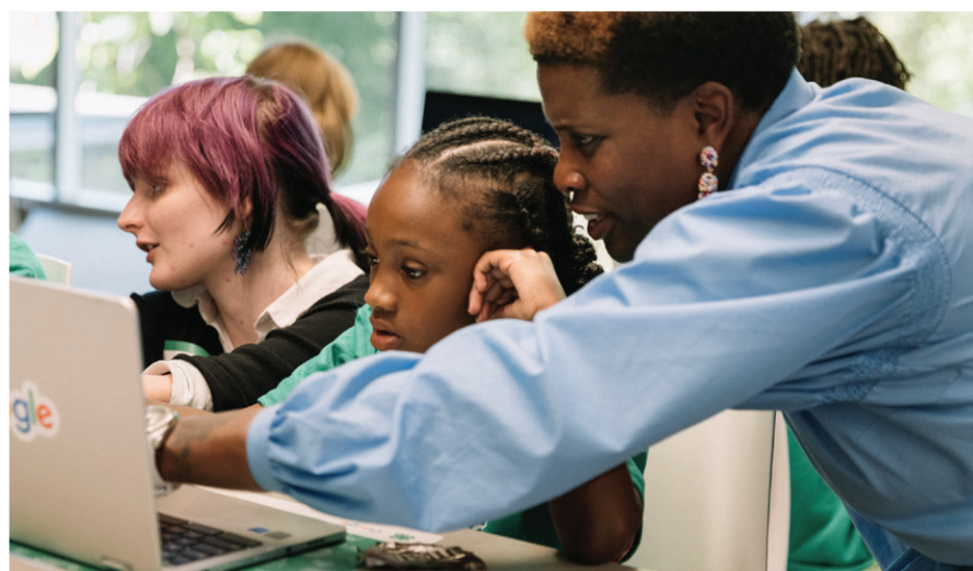
The Ohio State University

Every self-determined 4-H project can be broken down into areas of interest. These are the specific thing members want to address during their project adventures. Using the 4-H 365 Self-Determined Project Guide, identify three areas of interest with at least three activities per area to explore. One area of interest should include coding a project to take to county 4-H judging. Examples include a Sphero robot, Apple Swift Coding, app development, or something using