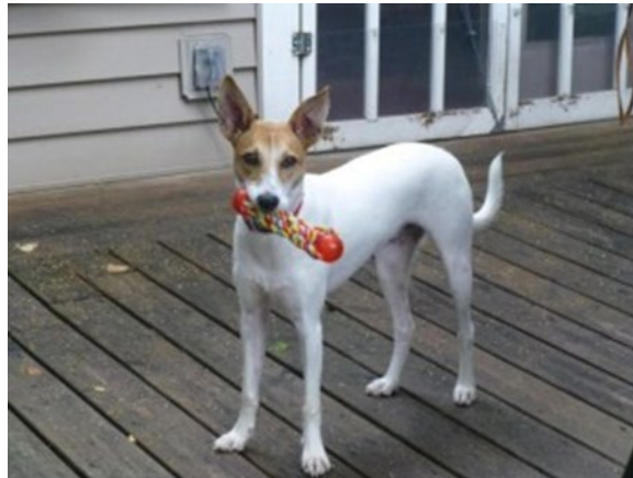
Bart (arrived 2013)