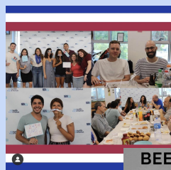
BEER MAKING 101 HOSTED WITH A LOCAL BREWERY