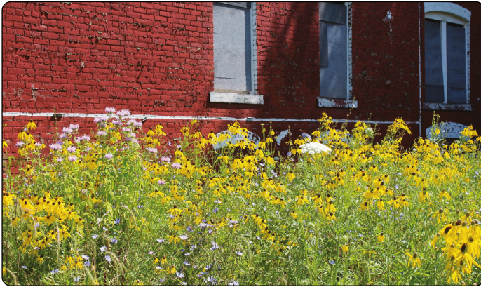
Figure 3. Urban pocket prairies established on vacant land are likely to contain a mixture of seeded species (eg gray-headed coneflower [ Ratibida pinnata ]; bee balm [ Monarda fistulosa ]) and weedy plants that are sometimes viewed unfavorably by neighbors (eg chicory [ Cichorium intybus ]; Queen Anne's lace [ Daucus carota ]). In our experience, weedy species are ecologically beneficial because they are key resources for urban bees, especially in shrinking cities. We have documented 98 bee species using weedy plant species as forage, which represents approximately 20% of Ohio's known bee fauna (Sivakoff et al. 2018).

tation (Threlfall et al. 2015), whereas adding patches of native vegetation to community food gardens in New York City did not influence bee community composition (Matteson and Langellotto 2011). When evaluating the relative attractiveness of plants to bees based on plant origin, it is important to recognize that the designation of forage as “native” rarely takes into consideration a bee's native range (Hanley et al. 2014). For instance, most bumblebees in the UK are Palearctic species, as are many common garden plant species (Hanley et al. 2014), so comparing bumblebee visitation to British native and Palearctic plants is not necessarily illustrative of native versus exotic forage preferences (Hanley et al. 2014). In addition, non-native forage may prove sufficient for a diverse community of polylectic bee species (ie generalist species that consume pollen from a variety of unrelated plants), whereas promoting range-restricted specialist species may require reintroduction of native plant communities (MacIvor et al. 2015).