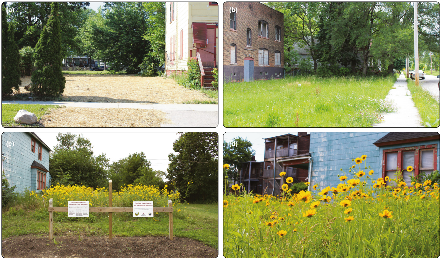
Figure 1. (a) The shrinking city of Cleveland, Ohio, has lost over 50% of its peak population, resulting in an overabundance of infrastructure that is eventually torn down, thereby creating vacant lands. (b) Across the city, over 27,000 vacant lots are maintained with monthly mowing; these lots are dominated by non-native turf grasses and common weedy plant species. (c and d) In 2013, we initiated a large-scale field experiment to determine if management or landscape context influenced the conservation value of these habitats for arthropods. Our study compared eight vegetation treatments across a network of 64 vacant lots; four treatments were “pocket prairies” that incorporated native Ohio forbs and grasses at varying levels of species richness.

tion decline, an overabundance of green spaces in the form of vacant land can be perceived as a symbol of blight (Nassauer and Raskin 2014). Conservation outcomes therefore depend on ecologists recognizing and incorporating the diverse goals and perspectives of people living nearby (Gobster et al. 2007; Hunter and Hunter 2008; Nassauer 2012). If residents disapprove of a conservation site, they may undermine it through vandalism (Figure 2), whereas if residents support the development of a green space, they may advocate for its funding, vote for local green initiatives, or volunteer to help with management of local pollinator habitats.