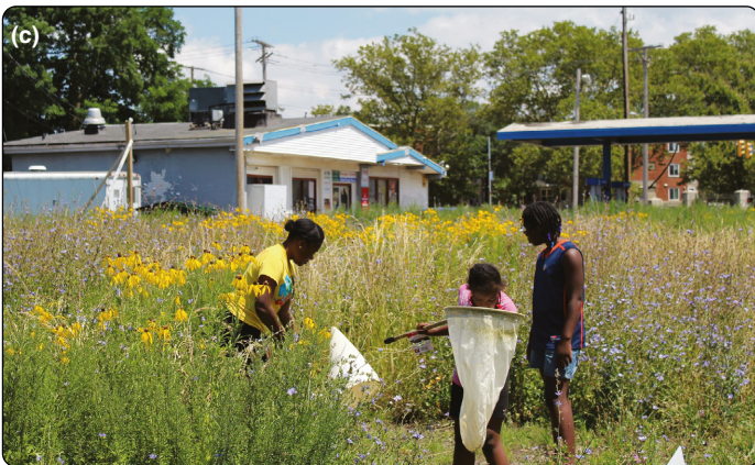
Figure 4. An individual site can inspire both positive and negative feelings. (a) We received an email from citizens expressing concern about their safety (b) when walking by our pocket prairie research site pictured here. (c) In that same week, parents and children enjoyed searching for insects at an outreach event. To address safety and aesthetic concerns, we established “cues of care” by fencing and mulching the front of each site, adding informational signage, mowing a 1-m-wide border around the front and sides of each pocket prairie, and removing trash on a biweekly basis (Nassauer and Raskin 2014). Management must be dynamic and time-sensitive, as well as address when sites are less aesthetically pleasing (eg flowers are not in bloom).