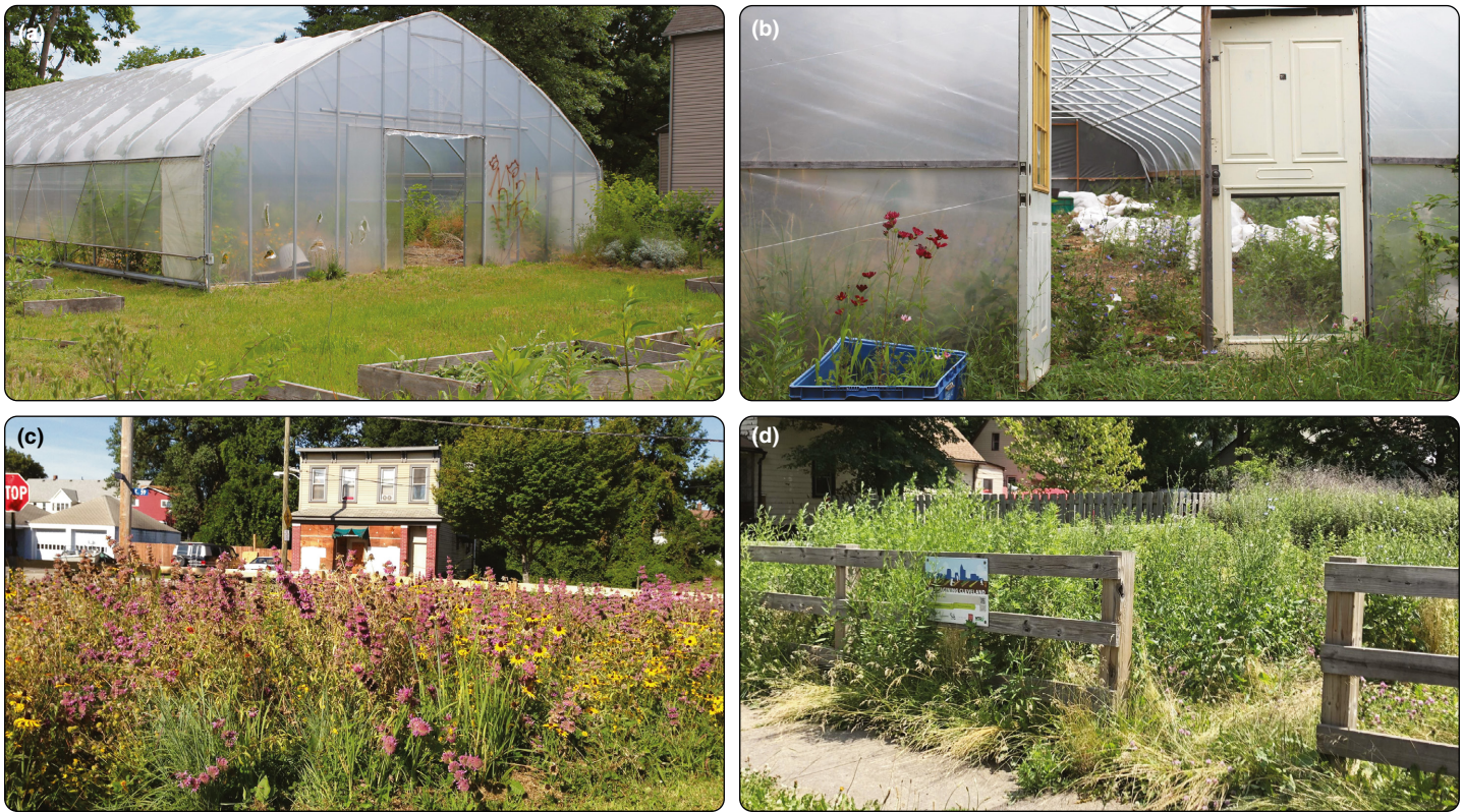
Figure 6. Enthusiasm can sometimes give way to neglect. Financial constraints, lack of technical support, underestimation of time investment, or absence of long-term management plans can lead to abandonment, as in (a and b) the case of this urban farm's high tunnel. (c) In 2013, a public nonprofit partnership funded many revitalization efforts in Cleveland (re-published from Gardiner et al. 2013, printed with permission from Oxford University Press), (d) but by 2018 several of these sites were abandoned. Abandonment can inhibit neighborhood investment in current and future urban greening projects. Thus, we recommend that researchers overestimate the cost and time required for installation and upkeep of urban pollinator habitat.

Despite initial community support, urban conservation ventures can still fail in the absence of long-term economic and political backing (Hostetler et al. 2011; Hale and Sadler 2012). Without funding to subsidize regular visits to a site and cover the costs of routine management activities such as trash removal, neighbors may begin to perceive a green space as abandoned. In shrinking cities, this concern is justified, given that many greening initiatives are undertaken but are often discarded when maintenance time or costs become prohibitive (Figure 6). Therefore, sustainable urban conservation also depends on partnering with preexisting local groups who can provide reliable funding and have established neighborhood connections, as well as taking advantage of favorable governmental policies, tax breaks, or endowments that support and incentivize green infrastructure (Hostetler et al. 2011). Securing funding that allows continued maintenance can both alleviate neighborhood concerns about aesthetics or safety and help encourage the longevity and sustainability of a pollinator planting.