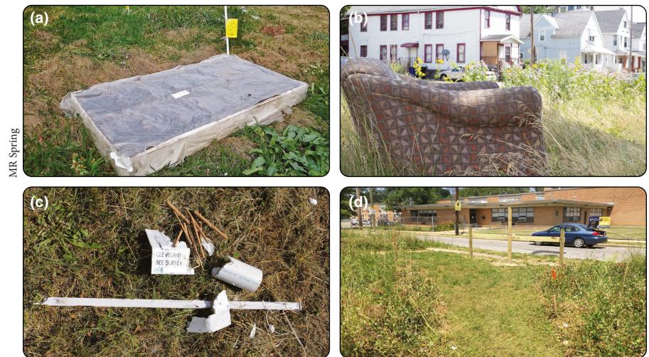
Figure 2. Negative interactions can occur between urban conservation projects and communities when the goal of developing new habitat is not effectively communicated and/or does not align with the values held by neighbors. (a and b) Urban conservation plantings are common sites for illegal dumping of tires and household goods, as well as vandalism of (c) sampling equipment, signage, and (d) even seeded plantings by unauthorized mowing.

Reducing management intensity of weedy forage has clear benefits for bees. Frequent cutting of vegetation has demonstrated detrimental effects on bee communities due to the elimination of foraging resources and nesting habitat, as well as through direct mortality (Wastian et al. 2016). However, tall