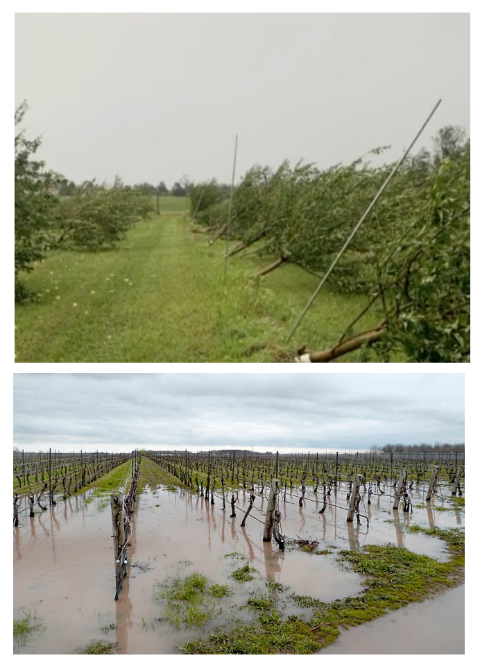
Figure 1. Top: Apple trees destroyed by a derecho in 2020 in Iowa. Bottom: Flood vineyard in Ontario in 2019.

In addition to meeting the more than 15% mortality for a stand after adjusting for normal mortality eligible orchardists must own the trees or vines (but not the land) when the natural disaster occurred and must replace the trees or vines within 12 months from the date the TAP application was approved.