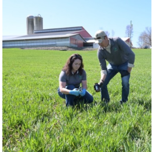
Figure 1. Ohio State University College of Food, Agricultural and Environmental Sciences in partnership with the Ohio Department of Agriculture collected plant samples from nearby farms in East Palestine.

Through cooperation with local agricultural producers and landowners, sampling sites were selected to represent both an innerradius, spanning up to three miles from the derailment, as well as a background-radius, which included agricultural properties within three to five miles from the derailment but not exposed to potential contaminates. Inclusion of background sample locations is consistent with the approach soil sampling conducted under to the Preliminary Residential/Commercial/Agricultural Soil Sampling Work Plan.