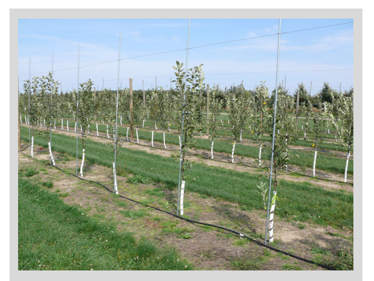
Figure 1. Drip irrigation in an apple orchard. See <u>factsheet</u> on types of irrigation systems for high density orchards.

Top Growth. In spring, not only are the trees blooming, but shoots are also growing and fruit buds for the following season are generally initiated within 50 days after bloom. All of this top activity takes adequate moisture. When there is moisture stress, tree cycles start to suffer. And the impact can be seen in impact on cropping via fewer flower buds the next season. Water stress in May can also reduce cell division in developing fruit, resulting in smaller fruit size potential. Early thinning to eliminate inter-fruit competition is important in Early thinning is especially spring drought. important for peaches to allow adequate fruit size potential.