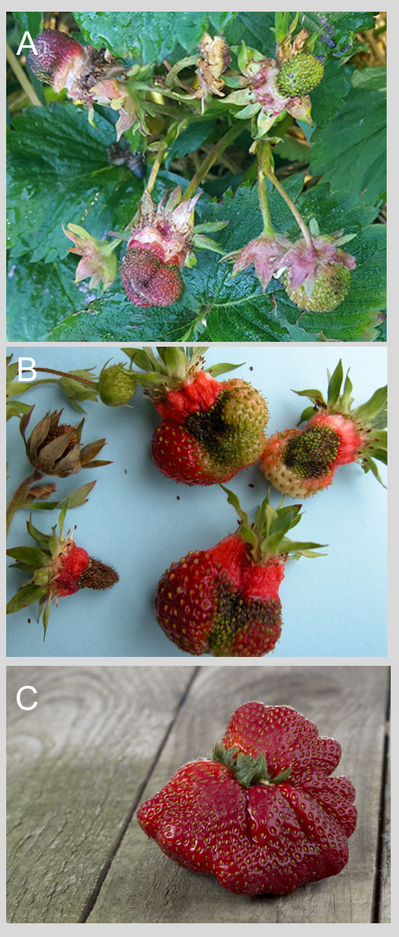
Figure 2. Symptoms of poor pollination (A), frost injury (B), fasciation (C, Images courtesy of Mark Longstroth, MSU Extension (A), Ministry of Agriculture Food & Rural Affairs, Ontario, Canada (B).

While many insect pests can affect the quality of strawberry fruit the tarnished plant bug is notorious for causing misshapen fruit.