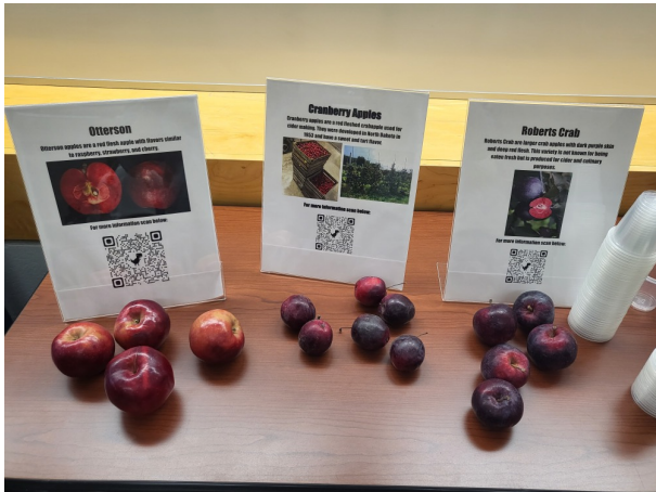
Figure 3. Three red flesh apple cultivars (Otterson, Cranberry, and Roberts Crab) being evaluated at Michigan State University for juice and cider production.

We also visited the greenhouses and learned about techniques being used to manipulate fruit tree architecture and learned about advances in irrigation sensors. I'm looking forward to the 2023 conference in New York state!