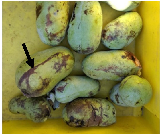
Figure 3. Pawpaw fruit from trees sprayed with captan. The arrow points to chemical damage on the fruit.