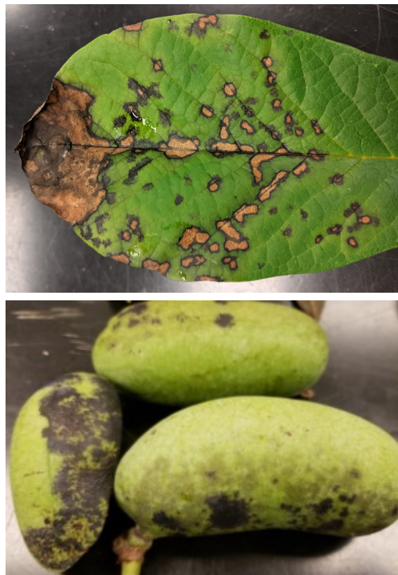
Figure 1. Phyllosticta spp. on pawpaw leaflet (top) and fruit (bottom).

In 2021, in collaboration with an Ohio pawpaw grower a study was conducted to evaluate the effectiveness of captan in managing Phyllosticta disease on leaves and fruit. Pawpaw trees (cultivar KSU Chappel) were sprayed with captan