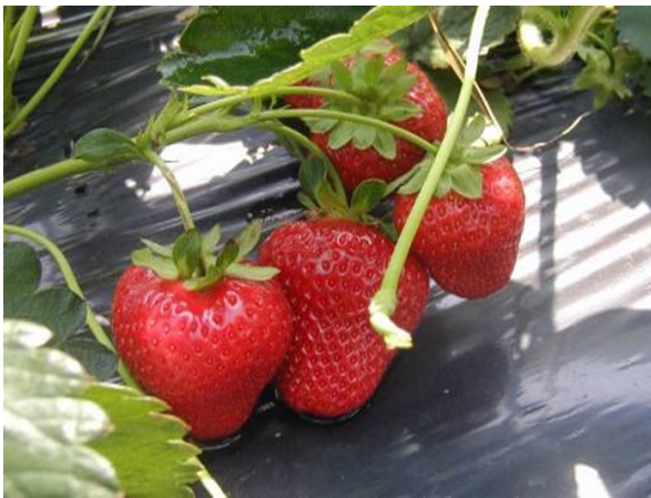
Prescription Nutrient Management is Critical for Plasticulture Strawberry Success