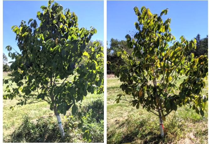
Figure 2. Pawpaw tree sprayed with captan (A) and tree that was not sprayed with captan (B).

This research was supported by an Ohio Department of Agriculture Specialty Crop Block Grant Award No. AWD-106542.