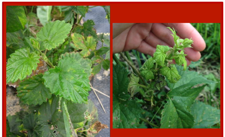
Figure 1. Downy mildew symptoms on basal spikes.

Selecting cultivars that are highly or moderately resistant to downy mildew is the ideal method for controlling hops downy mildew. Backyard and organic growers are strongly encouraged to plant resistant cultivars in order to reduce or eliminate the need for fungicide applications. There are many public hop cultivars that are resistant or moderately resistant to downy mildew (Table 1). However, some of the more popular cultivars grown in the Midwest including 'Cascade', 'Chinook', 'Nugget', and 'Galena' are susceptible to downy mildew. Purchase rhizomes or starter plants from a reputable propagator or nursery that uses best propagation, sanitation and other integrated disease management strategies.