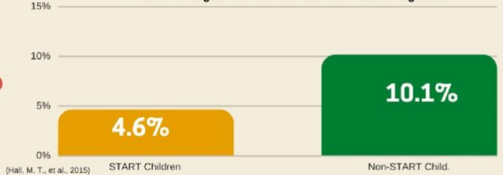
What Percentage of Children Will be Re-abused or Neglected?

CHILDREN WHOSE PARENTS HAVE PEER MENTORS ARE LESS LIKELY TO BE RE-ABUSED OR NEGLECTED