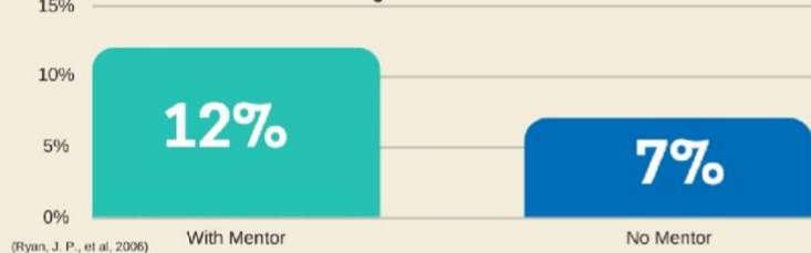
What Percentage of Families were Reunified?

PARENTS WITH A MENTOR ARE MORE LIKELY TO BE REUNIFIED WITH THEIR CHILDREN