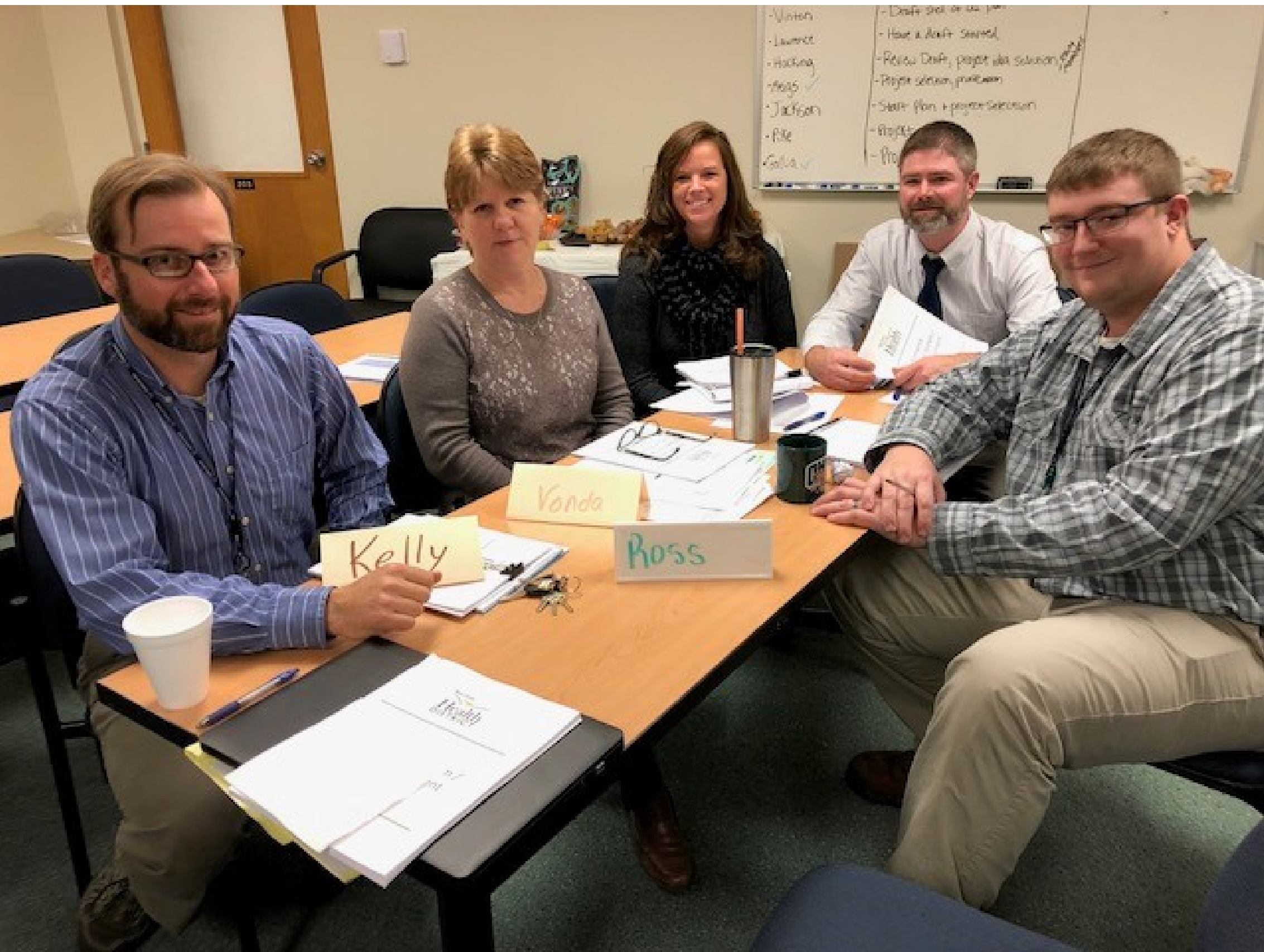
Ross County Health District Quality Improvement team during the in-person QI training.