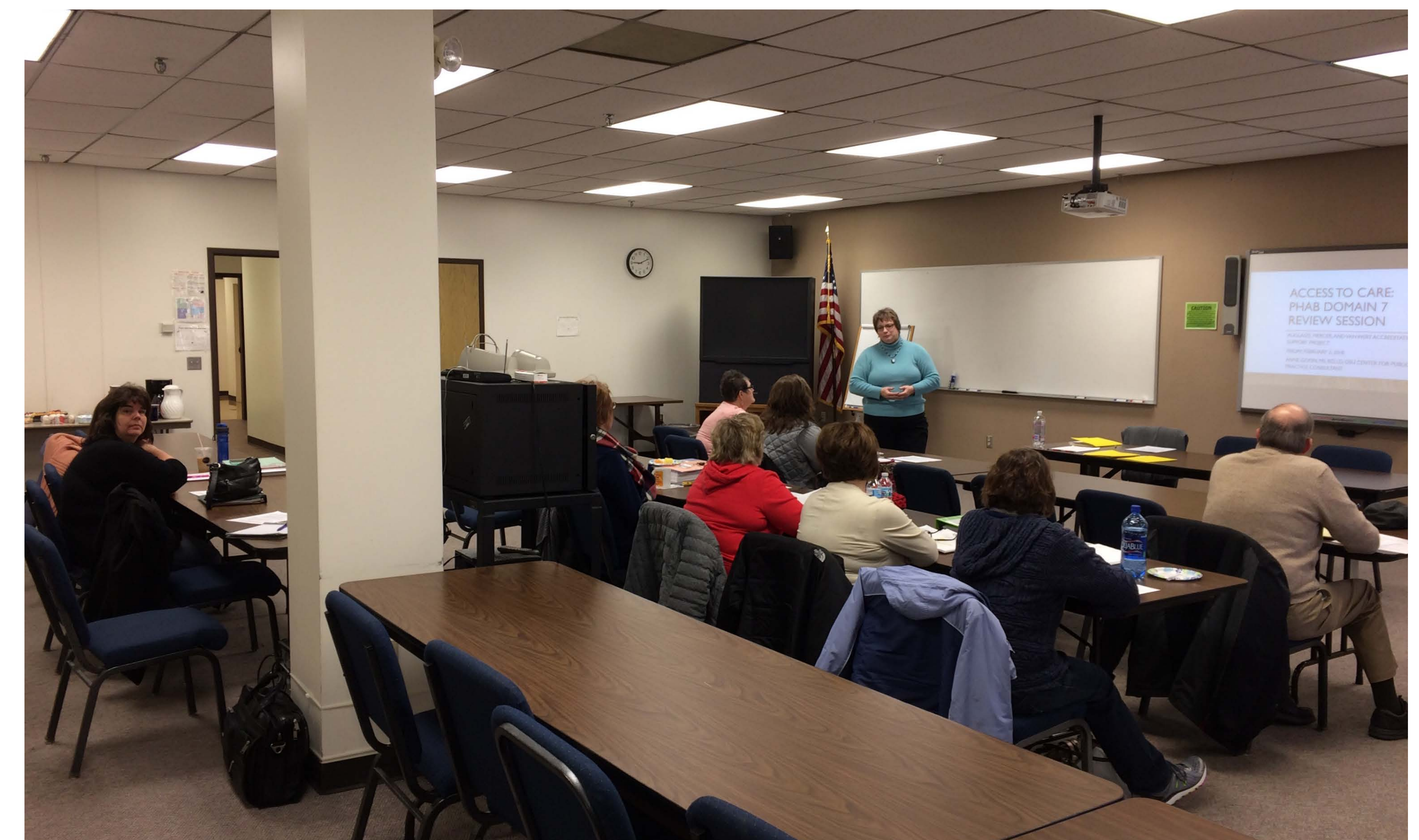
Project participants attend Domain 7 review session at Mercer County Health District on 2-2-18

MERCER COUNTY HEALTH DISTRICT AUGLAIZE COUNTY HEALTH DEPARTMENT VAN WERT COUNTY GENERAL HEALTH DISTRICT