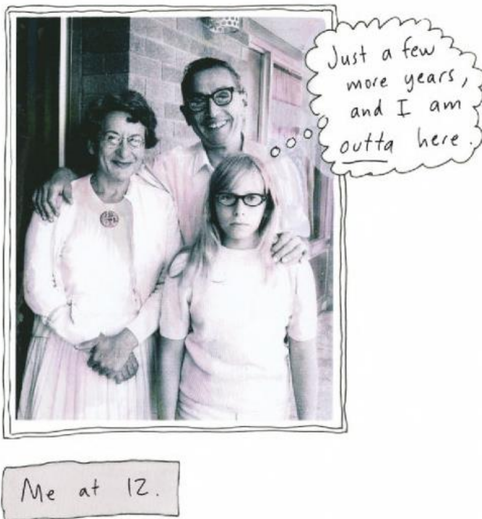
Figure 13 (p. 179)

Strikingly, Chast ends the memoir with a return to embedded fictionality solely within the verbal track: her account of her recurrent dreams about her parents, dreams that capture so much of her actual feelings about both of them as they faced the end of life (figure 14). Again the embedded fictionality makes a tight link between the invented and the actual. Finally, Chast's choice to restrict herself to verbal narration emphasizes the actual absence of her parents from her life, even as the dreams themselves indicate that she is still working out her relationship to them, especially her mother.