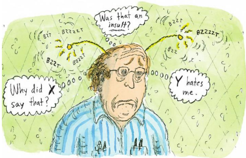
Figure 8 (p. 31)

And, more important, he was kind and sensitive. He knew that my mother had a terrible temper, and that she could be overpowering. She had a thick skin. He, like me, did not. She often accused my father of "walking around with his feelers out."