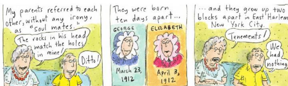
Figure 2 (p. 7)

These two figures also help clarify the distinctions among representation, construction, and fictionalization. The photographs, the sketches, and the comics are all modes of representation and all provide a certain selection and perspective on the actual people and events they depict—though of course the comics and the sketches emphasize Chast's constructive agency more than the photographs do (that's one difference between the camera and the pen). From the rhetorical perspective, though, it is worth distinguishing between foregrounding construction and fictionalizing because construction can be in the service of either reporting actual states of affairs or inventing non-actual states. A little reflection on Chast's sketches supports this point. In those sketches, Chast gives us a clear construction, something very different from a photographic image of her mother, but she is obviously communicating a nonfictional representation of her. I view Chast's comic style, then, as something that (a) foregrounds her constructive activity and (b) establishes a baseline of nonfictional representations that she deviates from as she moves into the inventions of fictionality.