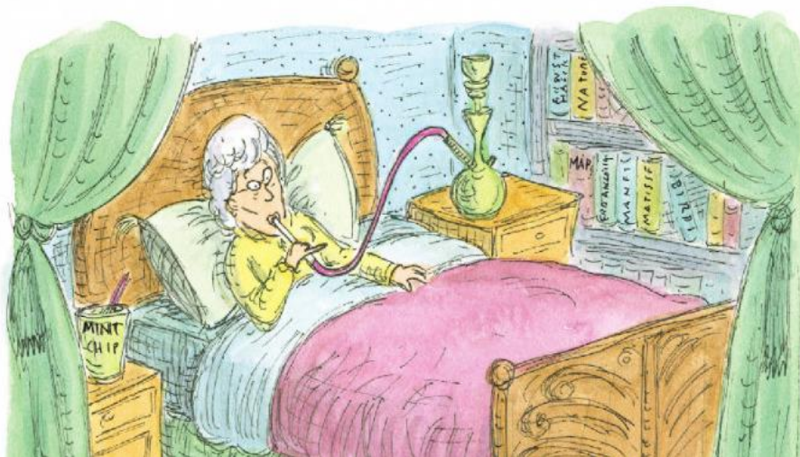
Figure 3 (p. 164)

I wish that, at the end of life, when things were truly "done," there was something to look forward to. Something more pleasure-oriented. Perhaps opium, or heroin. So you became addicted. So what? All-you-can-eat ice cream parlors for the extremely aged. Big art picture books and music. Extreme palliative care, for when you've had it with everything else: the x-rays, the MRIs, the boring food, and the pills that don't do anything at all. Would that be so bad?