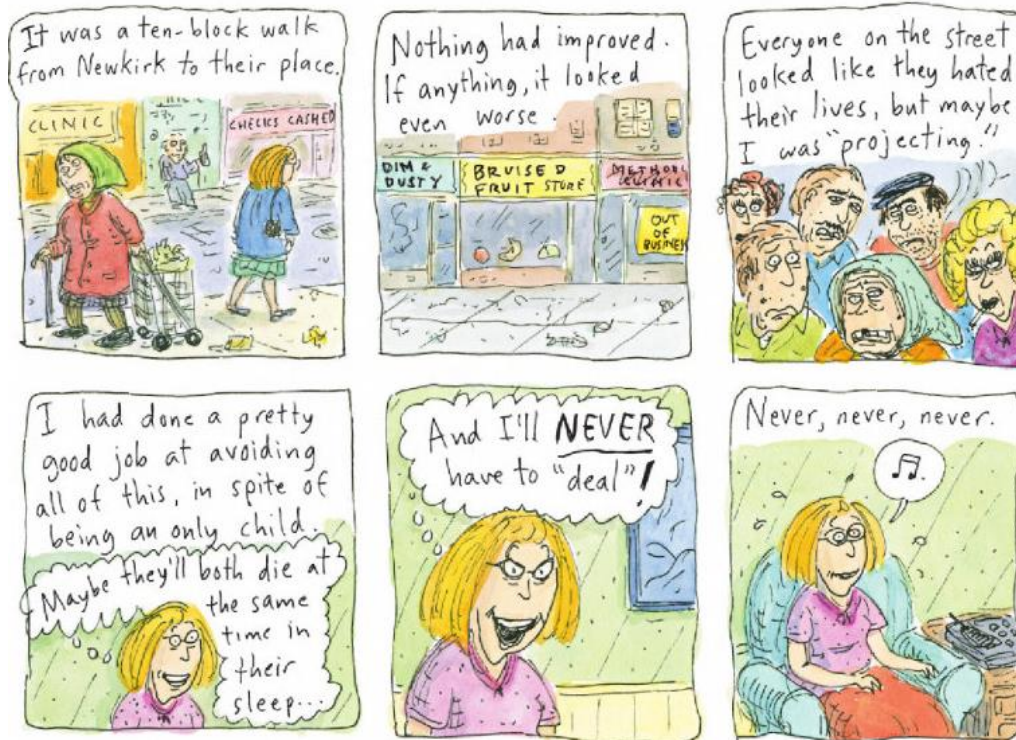
Figure 6 (p. 22)

In figure 6, we can see Chast embedding fictionality within nonfictionality as she introduces the larger issue of a plot for her parents' last years.