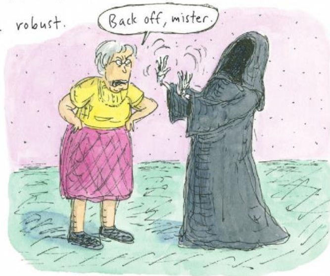
Figure 10 (p. 198)