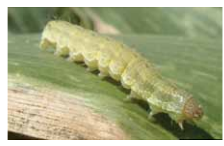
Old world bollworm larva