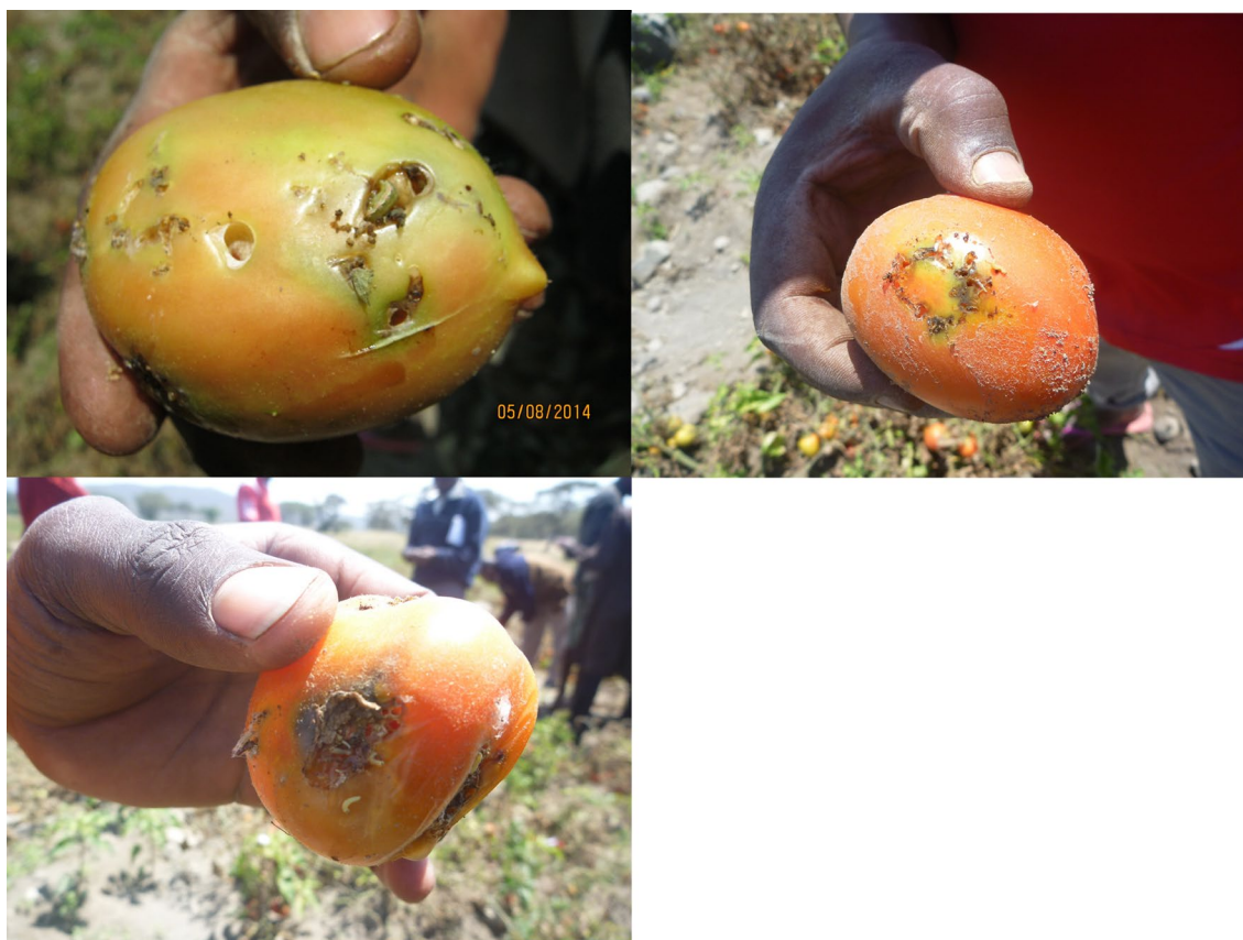
Fig. 2 Collection of samples of damaged tomatoes, soil, leaves and other plant debris for laboratory rearing and examination

In the survey, it was observed that the mean plant damage inflicted by the pest in all tomato fields was scored to be between 90 and 100 % (Fig. 4). This is the highest loss for tomato growers who have ever experienced (village extension officer verbal communication). The larva mines the leaves (Figs. 5, 6) producing large galleries and later burrows into fruits. The pest did not concern till June 2014 when growers started suffering enormous