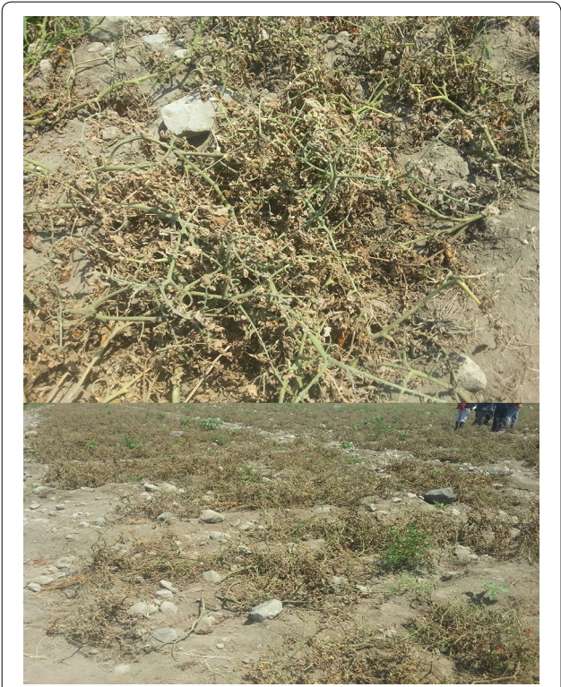
Fig. 4 Severely damaged tomato fields by Tuta absoluta