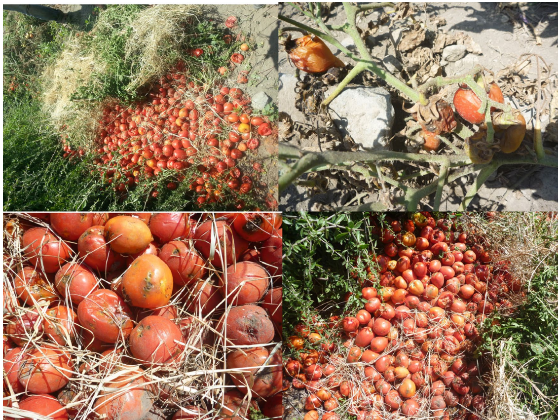
Fig. 6 Enormous tomato losses caused by Tuta absoluta in Ngabobo village