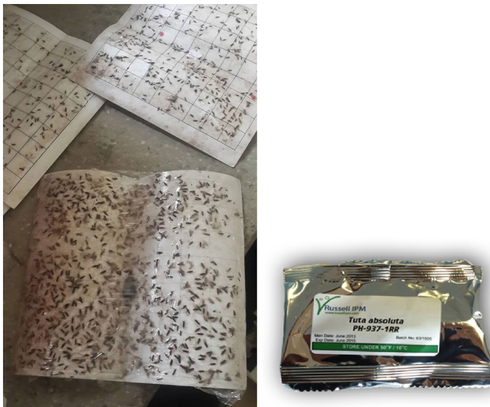
Fig. 3 Tuta absoluta specific pheromone traps (TUA optima rule) catches of adult male

tomato losses (Fig. 6) resulting in economic loss irrespective of high pesticide use. As reported in Senegal [10] and in Bulgaria [8], the plant damage symptoms, larva and adult morphological features observed under the microscope are typical of South American tomato leaf miner (Insecta; Lepidoptera: Gelechiidae; Tuta absoluta , Meyrick 1917).