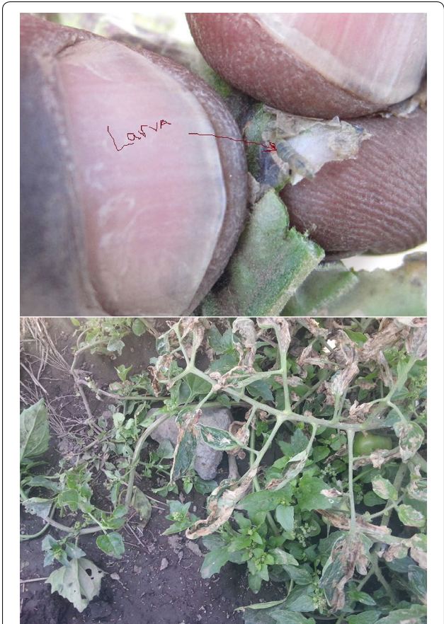
Fig. 5 Leaf damages between upper and lower epidermis of a leaf by Tuta absoluta in Ngabobo village