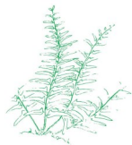
Crane Hollow Preserve