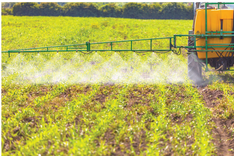
Many weeds have developed resistance to multiple herbicides, and worse, multiple modes of action

Herbicides used to be extremely effective (and sometimes still are), but by the fall of 2021, 264 species of weeds worldwide had developed resistance to herbicides, according to the International Herbicide-Resistant Weed Database. Seventy-one countries have reported herbicide-resistant weeds in 95 different crops. In the