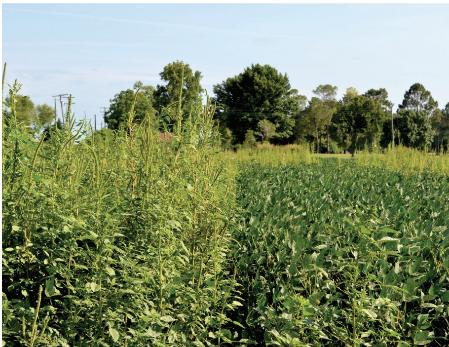
A field infested with Palmer amaranth.