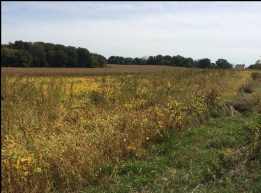
Mahoning county, OH 2015