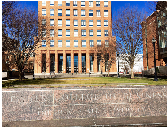
This March, the Fisher College of Business will celebrate its 100th birthday.

Boasting a top 20 ranking as a public undergraduate business school and catering to 6,093 full-time students, the Max M. Fisher College of Business has grown since its founding as the College of Commerce and Journalism in 1916. And on March 7, Fisher will have a new milestone to add to its list of accomplishments — 100 years in business education.